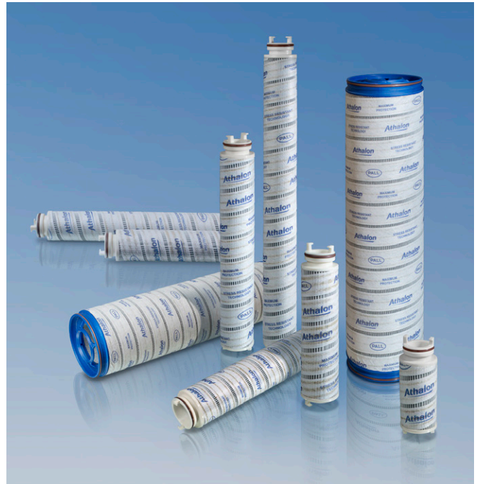
Athalon anti-static filter elements